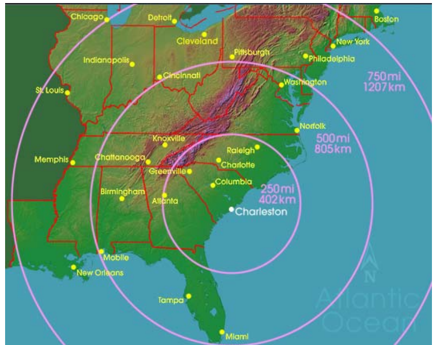
From a geographic perspective, Charleston is strategically located for companies engaged in global commerce.